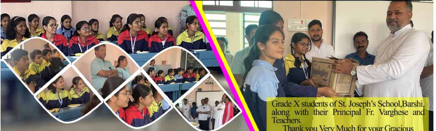
Visiting Friends and Collecting Precious Memories