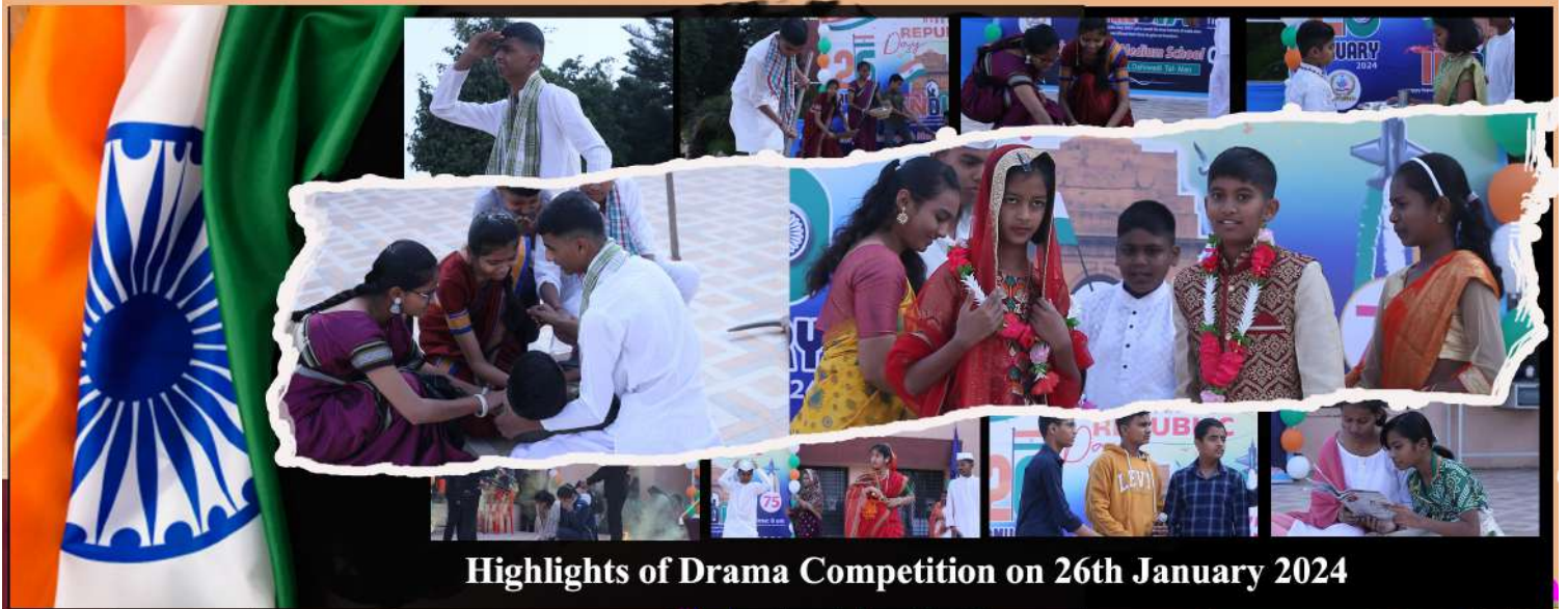
Highlights of Drama Competition on 26th January 2024

Let's appreciate those who made us proud and celebrate the spirit of a free India. May the spirit of patriotism light up our hearts as we remember the heroes, who fought for our freedom. Happy Republic Day to all proud Indians!